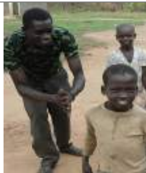
Praise your child