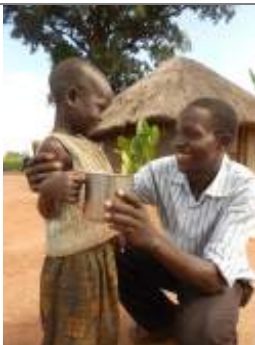
Get on the same level and use a soft voice