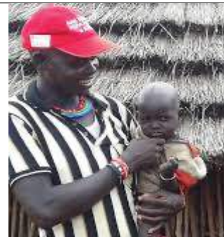
Sing, read, tell stories, or pray with your child