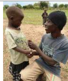
Listen patiently to your child