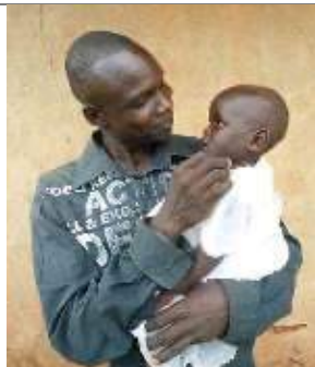
Hold and comfort your child