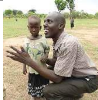
To correct your child, speak firmly without anger