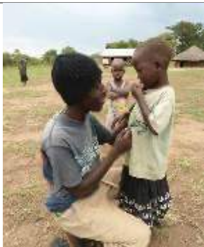
Teach your child