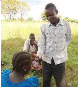
Respect your child's mother